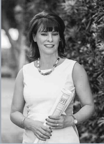
IMAGE MAKER: P&H Interiors Creates Stunning Designs That Are Actually Livable

Question: When did you first realize that you had an interest in interior design?