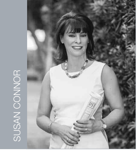
IMAGE MAKER: P&H Interiors Creates Stunning Designs That Are Actually Livable

Question: When did you first realize that you had an interest in interior design?